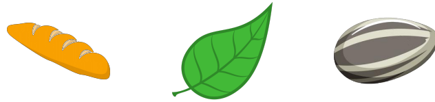
Figure 4: Representation of a bread, leaf and seed bonus.