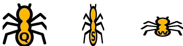
Figure 3: Representation of a queen, a soldier and a worker.